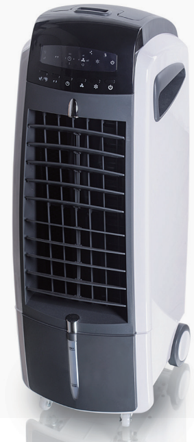
Product Dimensions (in): 9.8 (W) 12.4 (D) 28.8 (H) Net Weight: 5.3 kg / 11.6 lbs

Extremely energy efficient, the ES800 consumes only 2.7 watts* of electricity in QuietSleep mode – or about the equivalent of charging a smart phone. Additional unique features include a patent-pending water tank filter, an innovative water channel design and an elegant glowing water level indicator light. It also boasts gentle water stream sounds, universal voltage compatibility and a detachable power cord for easy storage and maintenance.