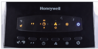
LED Control Panel